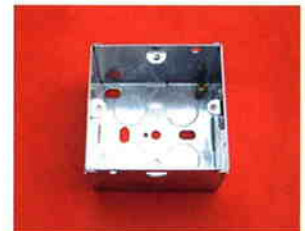
Standard 1 gang switch box