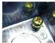
Terminal type C