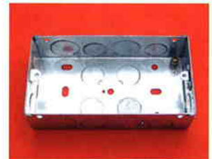
Standard 2 gang switch box