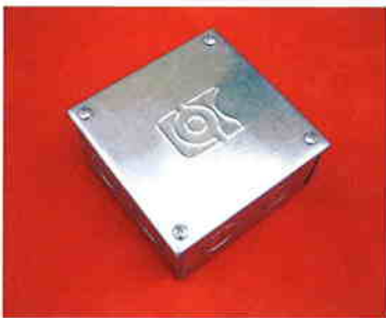
Supplied with cover & screws