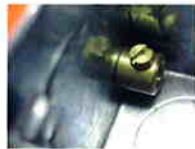
Terminal type B