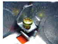
Terminal type A