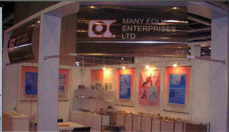
Exhibition at Asian Elenex 2008