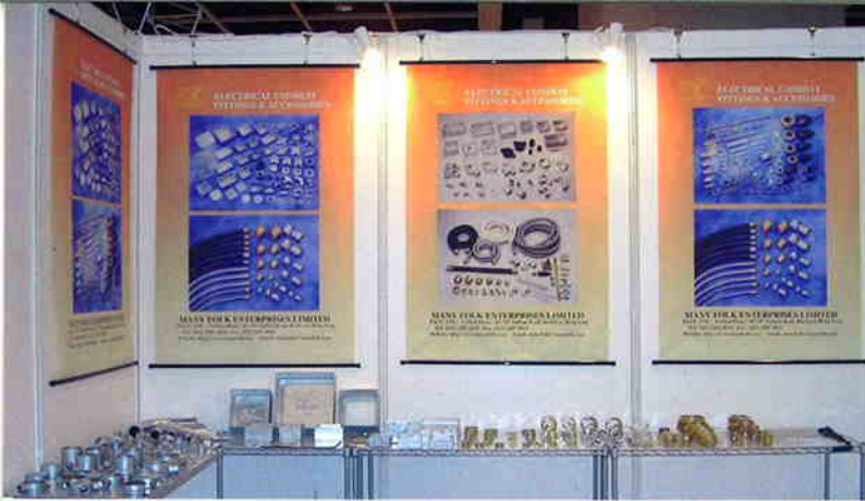
Exhibition at Asian Elenex 2004