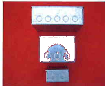
Junction box with Knockouts