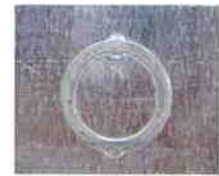
Double Knockouts (Inner KO: 20mm & outer KO: 25mm)