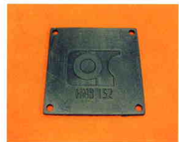
Option: Rubber Gasket