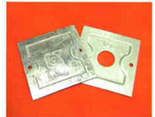
Cover for switch box